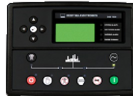
Control Panel B